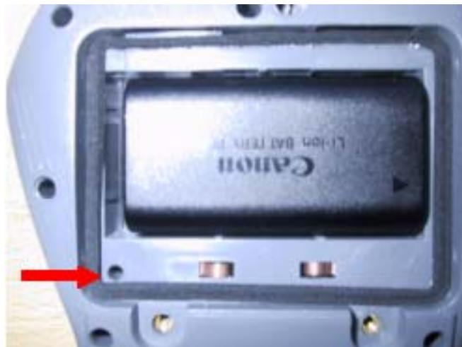
Location of the GX Reset Switch.

Document Part Number 32131100 (Revision A, 03-08)