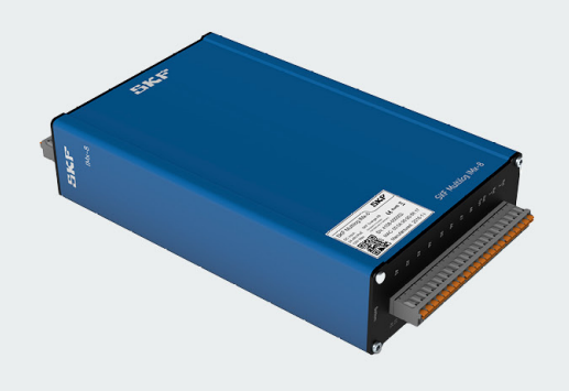
Compact version 8-channel IMx-8