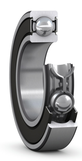
High performance RSH seal

SKF is making its high performance RSH seal design available on a larger range of SKF Explorer deep groove ball bearings. Applications requiring larger bearing sizes can now benefit from longer maintenance intervals and greater resistance to contamination.