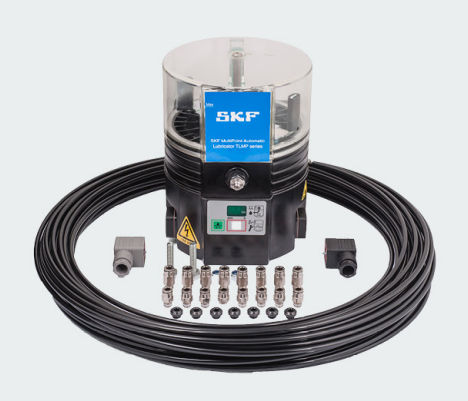
SKF MultiPoint Automatic Lubricator TLMP