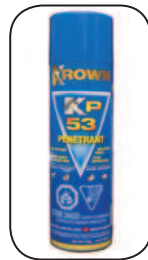
Fast Acting Penetrant Part # KA51400-12

Krown Fast Acting Penetrant will rapidly penetrate and loosen seized and rusted parts. This product is a solvent-free penetrant, which means the product remains on surfaces, lubricating and protecting from rust.