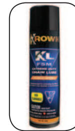
Chain Lubricant Part # KA63400-12

Krown Chain Lubricant is a solvent-free product designed to substantially enhance chain life while reducing wear and friction. Safe for self-lubricating chain, it will reduce corrosion and help to keep debris from sticking and causing costly repair and downtime. Engineered for high-heat applications.