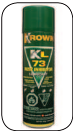
Corrosion Inhibitor Part # KA71400-12

Krown Corrosion Inhibitor is formulated to help control corrosion in the most damaging of environments. Unlike many competitive products, this rust inhibitor contains no solvents which are hazardous to the environment, dangerous to the user and damaging to paint, plastic and rubber.