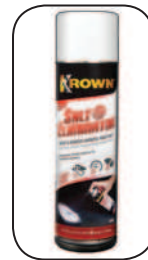
Salt Eliminator Part # KA1198-12

Krown Salt Eliminator is a very unique, equipment saving, protection product that makes the difficult task of salt removal easy. This proprietary formulation not only dissolves salt much more quickly, but also breaks the bond between chloride and metal while preventing the reforming of these salts after cleaning is complete.