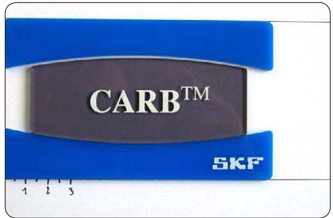
Fig. 4 Inner and outer rings aligned, roller in the equilibrium position and limited radial clearance. Note the scale is in cm.

To be frank, the best way to avoid the issues that I've described is to mount CARB toroidal bearings using the SKF Drive-up Method or, if the bearing is large enough, with SKF SensorMount. If there isn't the space to use a hydraulic nut, as is often the case with some fans, use the nut rotating angle method just like you would for a self-aligning ball bearing.