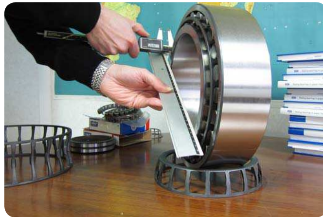
Fig. 7 Using a ruler and a vernier caliper to measure inner ring versus outer ring axial offset I.

You can now train yourself to measure the bearing clearance with a feeler gauge. Challenge your colleagues to measure the clearance and bet that they will find a value below 0,220 mm. I would expect between 0,140 and 0,190 mm.