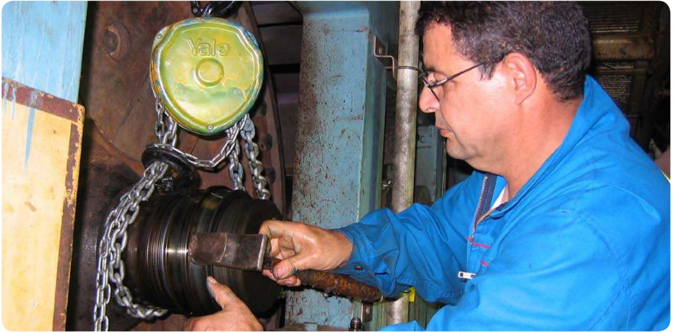
SKF technician checking bearing seat geometry with an inner ring and Prussian blue