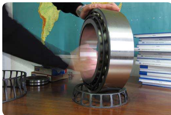
Fig. 9 Rotating the inner ring to free up a bearing blocked by too much axial displacement.