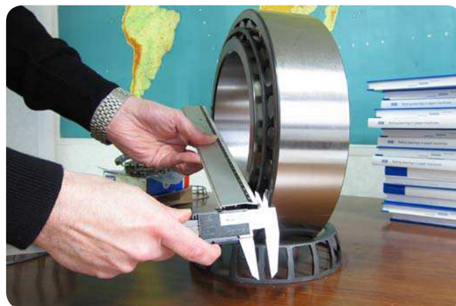
Fig. 8 Using a ruler and a vernier caliper to measure inner ring versus outer ring axial offset II.