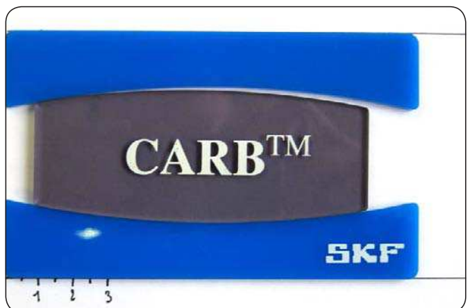
Fig. 6 Axial displacement of the roller leads to uneven clearance over the roller length.