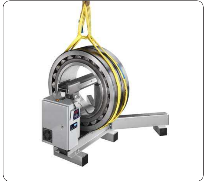
Fig. 1 SKF TIH L induction heater for bearings up to 800 mm bore diameter and 1 200 kg weight e.g. many Yankee cylinder bearings.