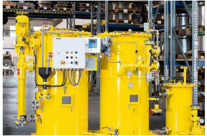
Booster pump design