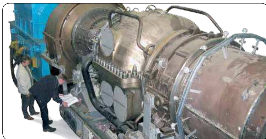
The gas turbine drives the electric generator and provides heat (hot water) in a cogeneration plant

© SKF is a registered trademark of the SKF Group.