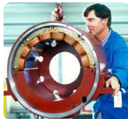
View of a 400 mm diameter radial magnetic bearing