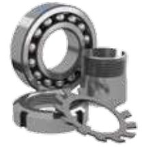
Tapered bore design