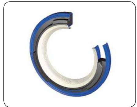
Bayonet PTFE seal