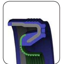
Fourth generation PTFE seal

© SKF is a registered trademark of the SKF Group.