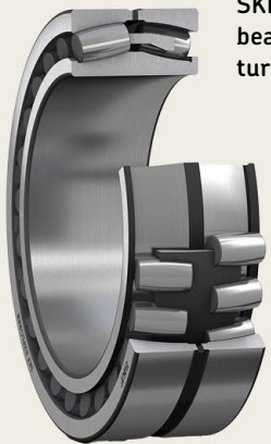
SKF spherical roller bearings for wind turbine main shafts.