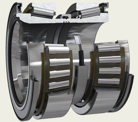
Truck hub unit for Scania.

SKF supplied its largest ever spherical roller bearing to be used within the mining industry.