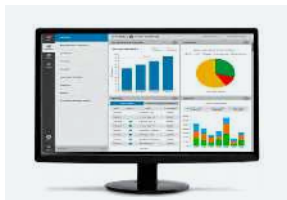
SKF @ptitude/ SKF Enlight