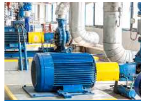
Machine data and controller interface