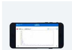
IMx-8 Manager app