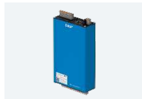
SKF Multilog online system IMx-8