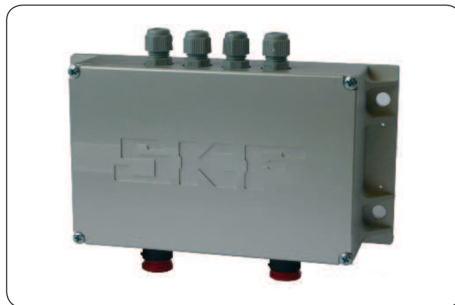
SKF Axletronic temperature monitoring system. Bogie junction box