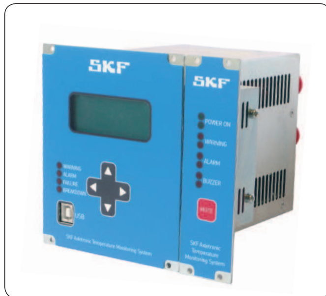
SKF Axletronic temperature monitoring system. Main unit (left) and drivers cab signalling box (right)

The system continuously checks all sensors, cabling and electronics for any fault, signal interruptions, shortcuts or power failure as well as anomaly in wiring installation. Any malfunction generates an alarm. In the case of power failure, the system will automatically restart when the power returns.