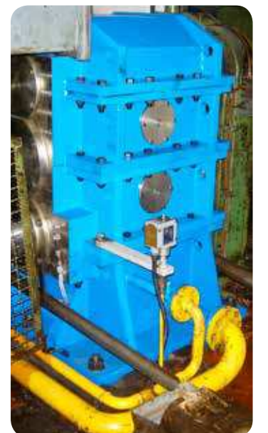
Shown here is the same gearbox, before and after a total refurbishment by SKF gearbox specialists at one of our Gearbox Remanufacturing Centres.