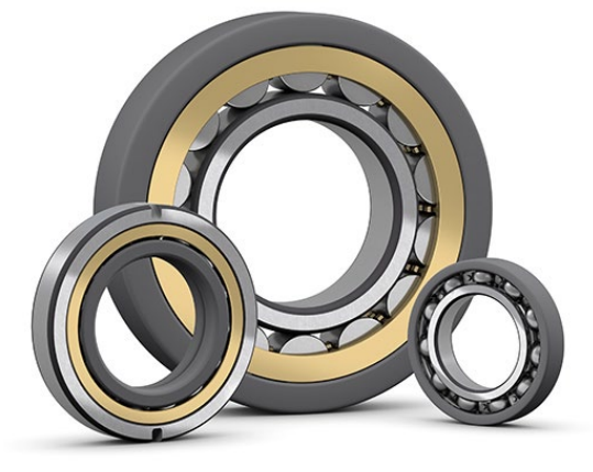
INSOCOAT bearings range

The powerful new Alfa Romeo Stelvio SUV is equipped with SKF's third generation, premium quality HBU3 hub units.