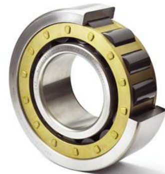
Super-tough stainless steel bearings for special applications