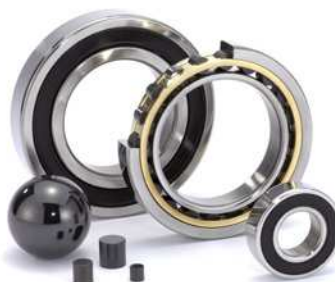
Hybrid bearings and ceramic rolling components

SKF has developed a new generation of hard, ultraclean, high-nitrogen steel with a high degree of impact toughness, high fatigue resistance and superior corrosion resistance when compared to common AISI 52100 bearing steel. The enhanced fatigue strength of this high-nitrogen steel, VC444, is associated with the coherent nature and fine distribution of the chromium nitride precipitates. The steel enables bearings to operate under corrosive and stress corrosion conditions caused by the presence of sour, acid and hydrogen gases and water. In addition, it enables engineers to design for increased bearing service life.