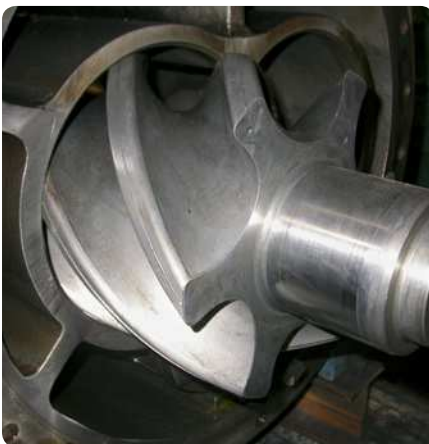
Open screw compressor with rotor