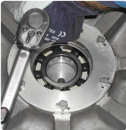
SKF bearing solution mounted in a cryogenic pump housing