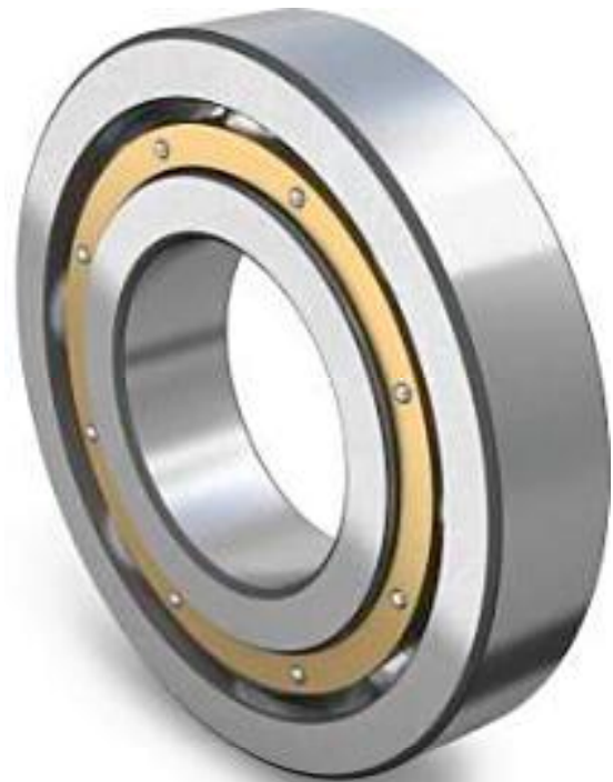
SKF deep groove ball bearing equipped with new brass M-cage