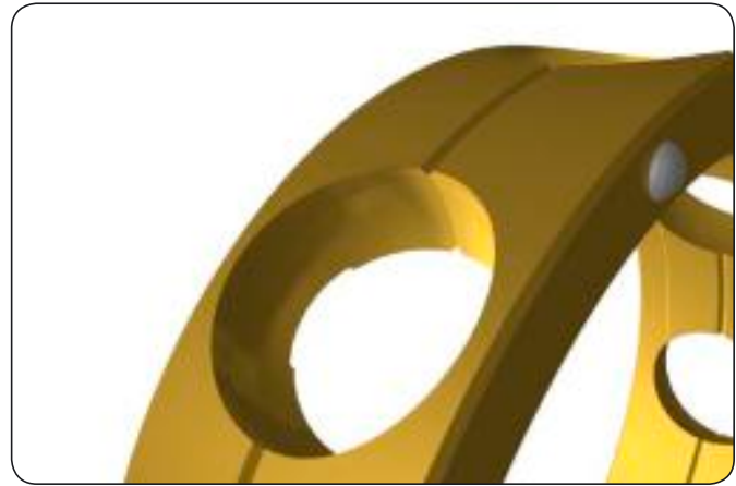
Detailed view of the newly redesigned M-cage pocket

For additional information, contact the SKF application engineering service.