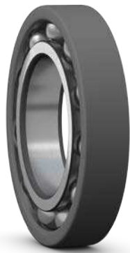
INSOCOAT bearing with new improved coating