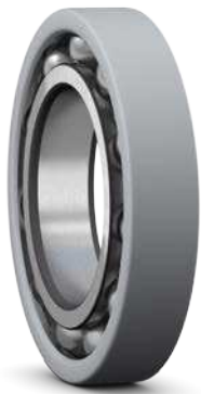
INSOCOAT bearing with previous coating