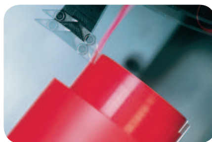
SKF SEAL JET system