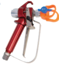
Broad spray gun Order #KA1181