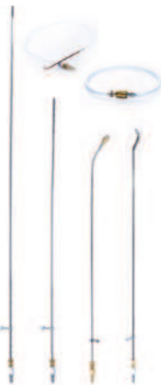
Spray rod set