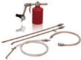
Small portable system Order #KA1022