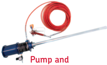
Pump and broad spray Order #KA3090