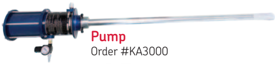
Pump Order #KA3000