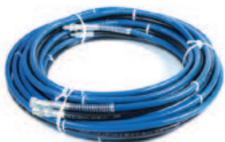
50' Line set