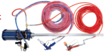
Pump & line kit Order #KA3062