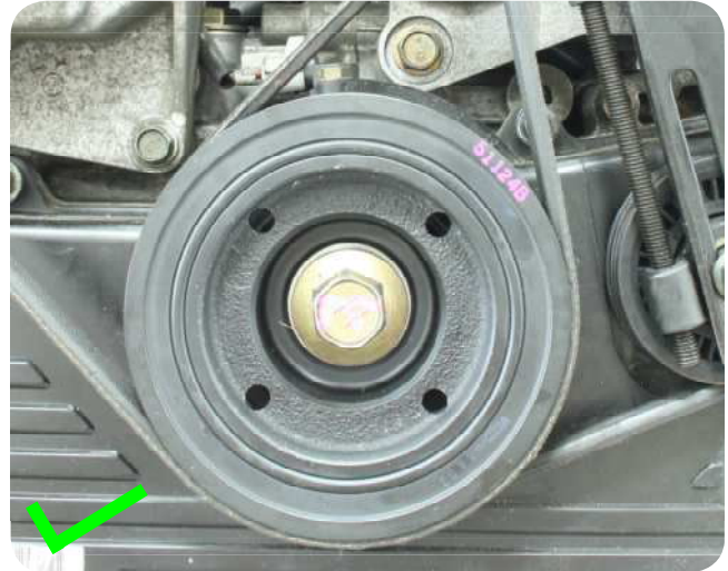
Aftermarket Power Pulleys vs OE Crankshaft Damper