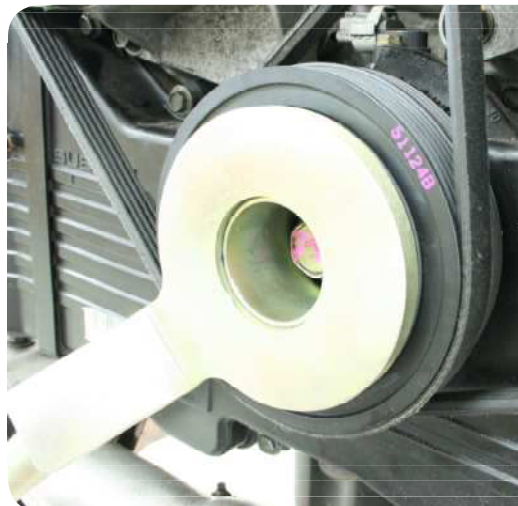
Crankshaft tool fit firmly onto OE damper