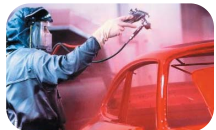
Automotive and Industrial Paint Booths