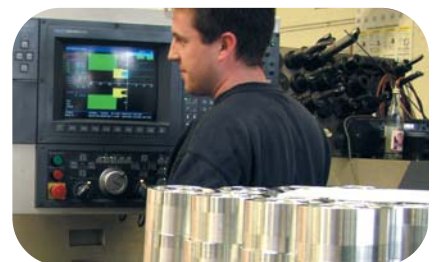
CNC machining operations