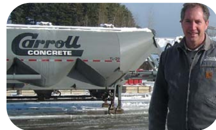
Concrete manufacturing plants