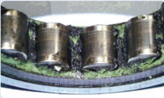
Lubricant degradation caused by electrical discharge currents