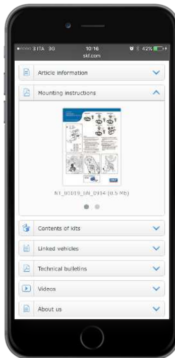
Specific fitting instructions