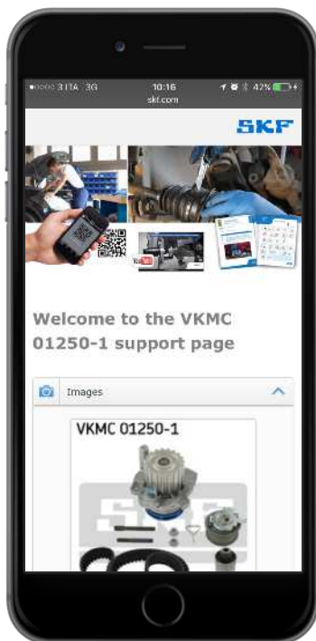
Detailed kit content

Further product information can be found in the SKF online catalogue available at vsm.skf.com or as a download via the SKF Automotive parts search app.