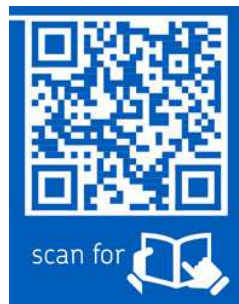
Product specific QR code on SKF boxes

The information is not only accessible quickly and easily but the technology allows us to update it as often as needed.