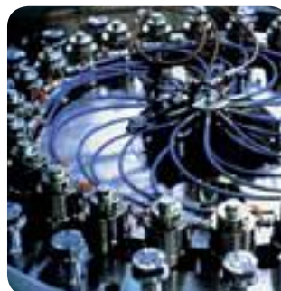
Simultaneous tightening with centralized power supply