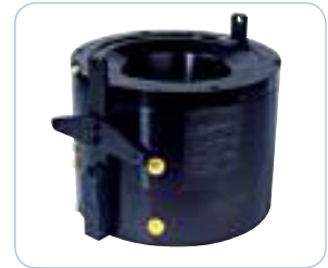
Tank tightening tensioner