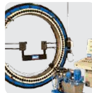
Simultaneous tightening of wind turbine blade orientation bearings