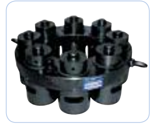
Monobloc 8-tensioner ring