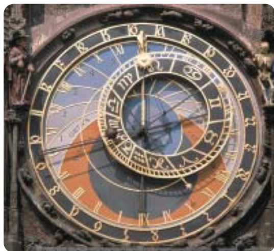
The innovative SKF OKCK coupling saves time in most types of wind turbines. Another innovative design showing time is the clock on St. Nicholas Church in Prague.

The SKF hydraulic coupling, for wind turbines (OKCK) is designed to fit within limited space, and yet still maintain the benefits of more traditional SKF OK couplings: quick and easy mounting and dismantling.