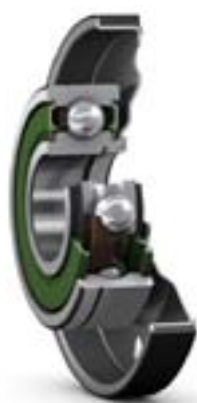
Rotor positioning bearing

Croatian rolling stock producer, Koncar KEV has finalized an agreement with SKF for the supply of bearings, axleboxes and associated equipment for its latest low-floor electric and diesel-electric multiple unit trains.