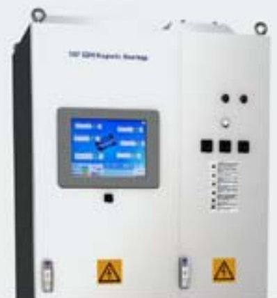
Enlight Centre 2.0