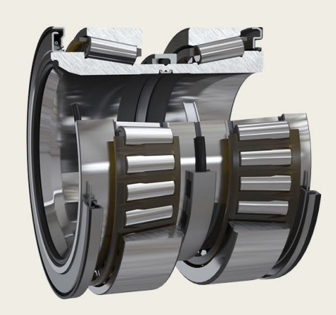
Truck hub unit for Scania.

SKF supplied its largest ever spherical roller bearing to be used within the mining industry.