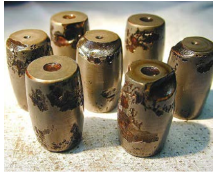
Rollers from a counterfeit spherical roller bearing

If installed in safety critical equipment, counterfeit products may present a great safety risk for people and/or the environment.