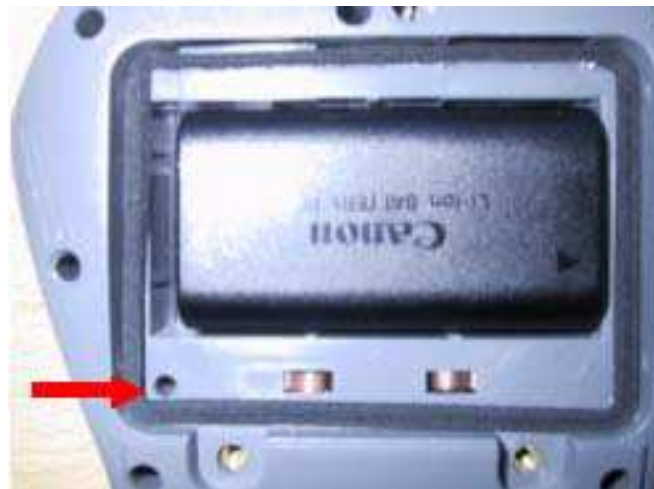
Location of the GX Reset Switch.

Document Part Number 32131100 (Revision A, 03-08)