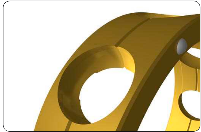
Detailed view of the newly redesigned M-cage pocket

For additional information, contact the SKF application engineering service.