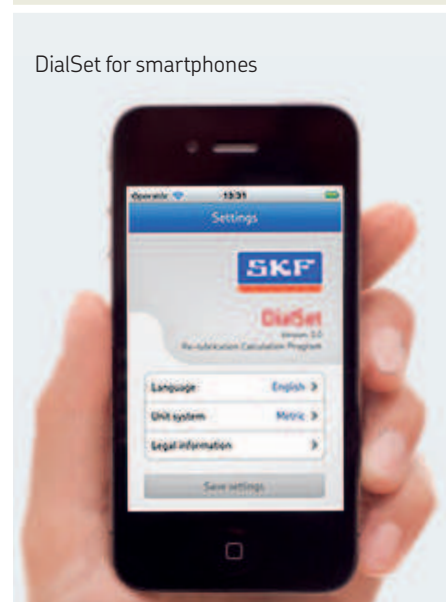
DialSet for smartphones