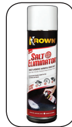
Salt Eliminator Part # KA1198-12

Krown Salt Eliminator is a very unique, equipment saving, protection product that makes the difficult task of salt removal easy. This proprietary formulation not only dissolves salt much more quickly, but also breaks the bond between chloride and metal while preventing the reforming of these salts after cleaning is complete.