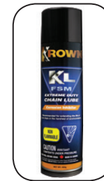
Chain Lubricant Part # KA63400-12

Krown Chain Lubricant is a solvent-free product designed to substantially enhance chain life while reducing wear and friction. Safe for self-lubricating chain, it will reduce corrosion and help to keep debris from sticking and causing costly repair and downtime. Engineered for high-heat applications.