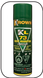
Corrosion Inhibitor Part # KA71400-12

Krown Corrosion Inhibitor is formulated to help control corrosion in the most damaging of environments. Unlike many competitive products, this rust inhibitor contains no solvents which are hazardous to the environment, dangerous to the user and damaging to paint, plastic and rubber.