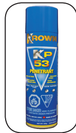
Fast Acting Penetrant Part # KA51400-12

Krown Fast Acting Penetrant will rapidly penetrate and loosen seized and rusted parts. This product is a solvent-free penetrant, which means the product remains on surfaces, lubricating and protecting from rust.