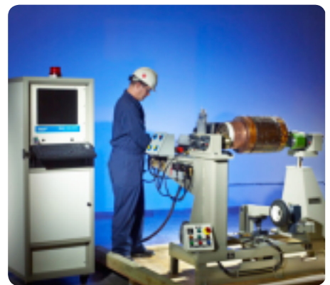
The Baker WinTATS automated traction armature test system for quality control and assurance

The standard test sequence involves a specified set of AC and/or DC hipot, resistance and surge tests for each armature. All tests